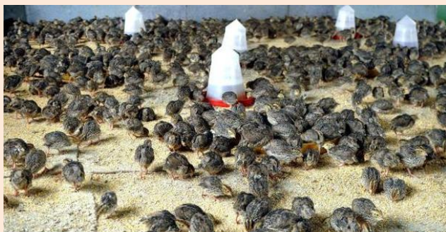
Deep litter housing system (Phuai hmanga enkawl)